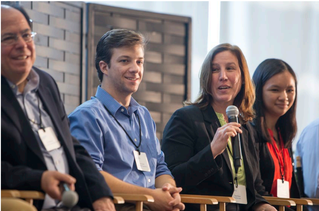
Figure 2. Sustainability Connect, held on May 9, 2016 at the Samberg Conference Center.

Researchers, staff, and students discuss living lab projects during a panel at Sustainability Connect.