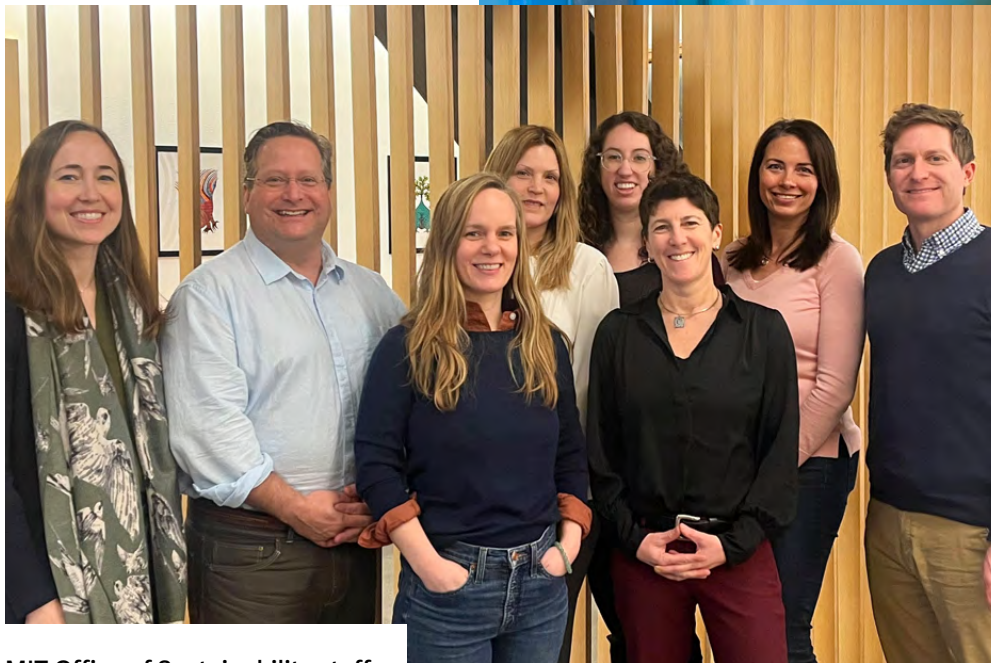
MIT Office of Sustainability staff